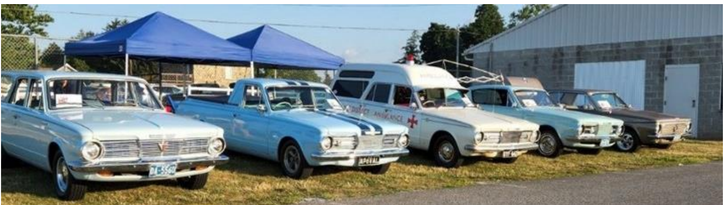
Australian A Bodies in the United States

He would make a good guest speaker who may also get more club members to come to the meeting that night to hear him and maybe see some more photos.